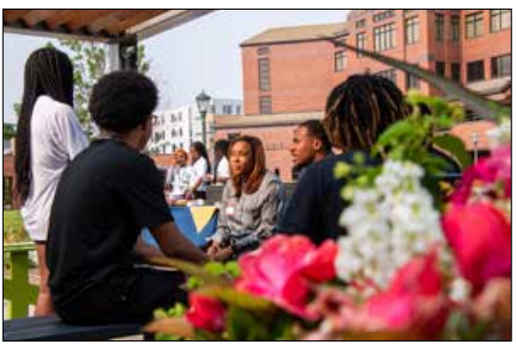
Class of 2023 students in the MKE CRE Summer High School Immersion Program network with Marquette alumni.

"At NAIOP, the diversification of real estate is incredibly important to us.