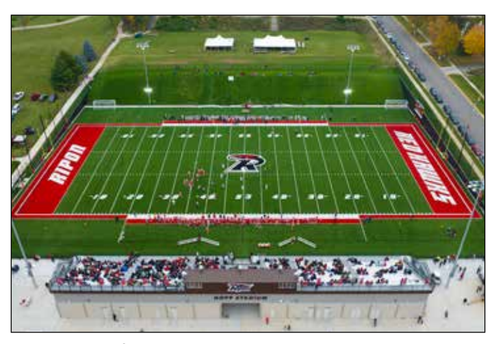
An aerial view of Ripon College's new, on-campus and mixed-use Hopp Stadium.

is designed to support Ripon's continued athletic excellence and enhance the overall student experience. This mixeduse space on the corner of Thorne and Union Streets houses the football and men's and women's soccer teams. Seating 2,000, the new stadium allows for a better fan experience for students