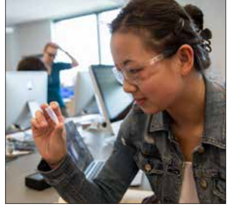
A Beloit student gains hands-on experience

The School of Health Sciences will prepare students for healthcare careers