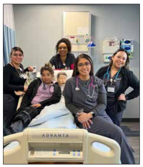
Herzing University proudly offers high-quality skills training and flexible career paths for nursing and healthcare students of all backgrounds.

As Herzing continues to provide exceptional education and support, the designation of a Hispanic-Serving