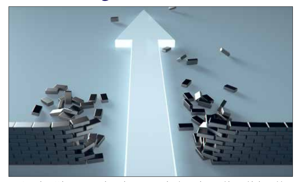
WAICU and WTCS have partnered together to remove barriers and to provide a guided transition to a higher education experience.

Our institutions understand that to reach foster youth, it is critical to engage with them well before they graduate from high school. That is why two WAICU institutions, St. Norbert College and Lakeland University, and two WTCS institutions, Northeastern Wisconsin Technical College and Lake-