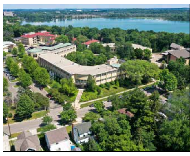
Aerial view of the Edgewood College campus.

online Master of Arts and online Master of Science degree programs were among the first to be introduced through this new partnership and delivery initiative. A brand-new online Doctorate in Business Administration (DBA) degree is next in the queue to be available for students worldwide.