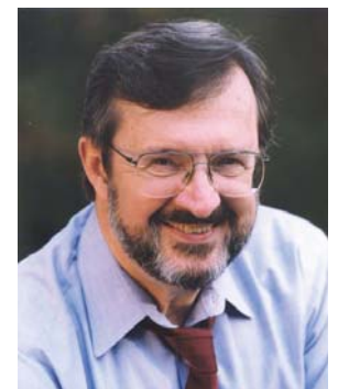
Obey was praised as a "sterling friend" of college students.