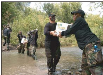
Crossing the Apple River and forming a supply chain became morning rituals for Character Quest participants.

One of Carthage College's main goals is to produce citizens who are actively engaged in their communities—in effect, to develop tomorrow's leaders.