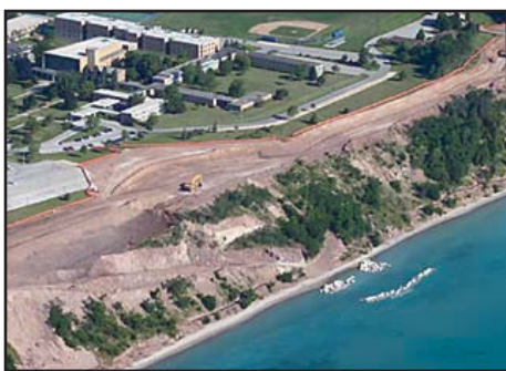
Bluff restoration project to educate students and benefit the community is right on track

Following nearly five years of research and planning, massive earth movers and bulldozers arrived on Concordia University Wisconsin's campus last June to begin the ambitious $8-million bluff restoration project.