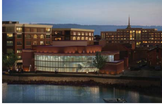
An artist’s rendering of the new collaborative Performing Arts Center in La Crosse.