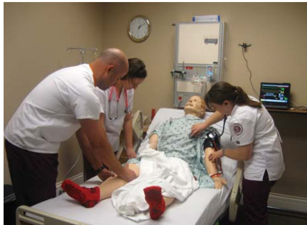
Students at Columbia College of Nursing practice their skills during a lab simulation.

Current WAICU members already produce 46 percent of the nursing graduates (BSNs) in the state. The addition of Columbia College reinforces the important role private, nonprofit colleges play in addressing occupational areas where there are critical shortages. ■