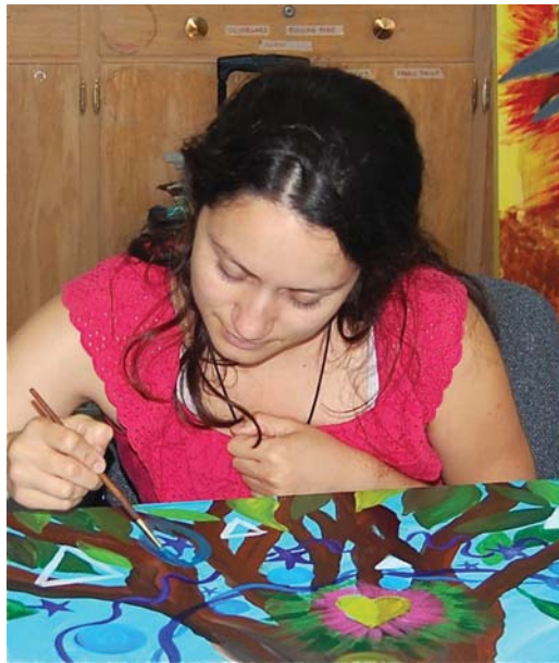
Mount Mary's doctorate program began with a summer colloquium.