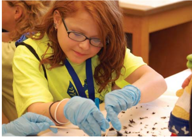
The Look Ahead Lakers program, funded through Great Lakes Higher Education Guaranty Corporation, has a communitywide impact.

continues to grow as the need for the program also rises. In less than a year, the number of participants has doubled: from 133 to 250 fifth graders, from 18 to 30 faculty and staff, and from 44 to 90 SLC students. As