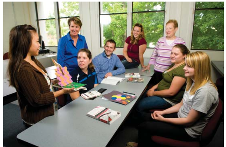
Marian students gather with staff to review the projects that were created after taking the StrengthsQuest inventory.