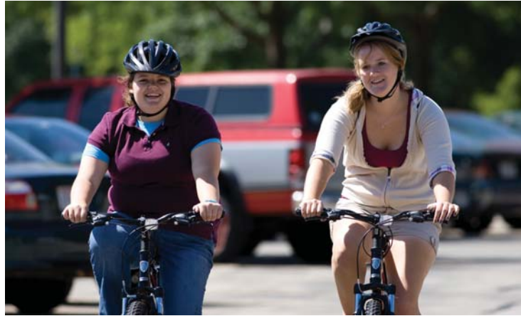
One truck's e-mail lament over a popular bike program

Sure, bikes are infinitely cheaper and easier to store and maintain, have zero emissions, contribute to the health and well-being of the rider, and are pound-for-pound