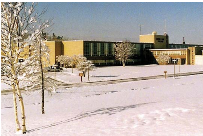
Silver Lake emphasizes real-world training in new program.

Silver Lake College has been chosen by the U.S. Department of Education to receive a prestigious Title III Grant. A priority of