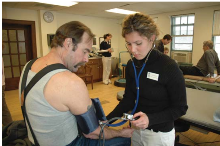
Carroll's new physician assistant program is expected to help ease the provider shortage.

Other community partners include the City of Milwaukee Health Department; La Casa de Esperanza, a Hispanic agency in Waukesha; and LifeCare Hospitals of Wisconsin in Pewaukee. ■