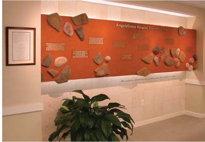
Donor Recognition Wall designed by MIAD’s Visual Resources Design Group for ProHealth Care’s AngelsGrace Hospice

designs, we were uplifted by the group’s enthusiasm, talent, and freshness and amazed by their talents. We always know that our work is going to be unique and thoughtfully created.” ■