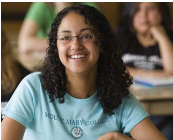
Mount Mary policy streamlines student transfer process

A new agreement between Mount Mary College and the University of Wisconsin System now makes it easier for students to transfer to the private college.