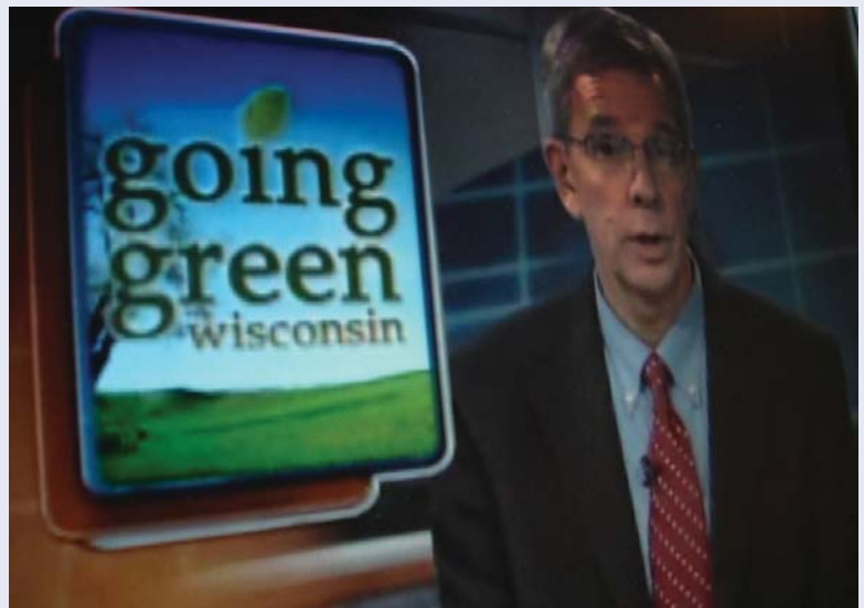
WAICU "going green" theme resonates with the news media.

The second "bright idea" saw WAICU colleges and universities replacing more than 25,000 light bulbs with high-efficiency compact fluorescents (CFLs). The effort will save money, energy, and reduce the carbon footprint of participating members. The program cost was underwritten by a Focus on Energy grant. ■