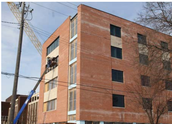
Viterbo's new $15.8 million School of Nursing facility is scheduled to open for students this fall.

business at Fort McCoy to serve members of the armed forces and others stationed in nearby locales.