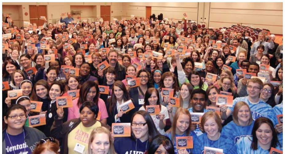
Students hold their “Protect Financial Aid” cards—get the message?

The students were there to support need-based financial aid for students attending all of Wisconsin’s colleges and universities—public and private, two-year and four-year. The campaign titled “Protect Financial Aid” is a partnership of the United Council of UW Students, the Wisconsin Technical College System Boards Association, and the Wisconsin Association of Independent Colleges and Universities.